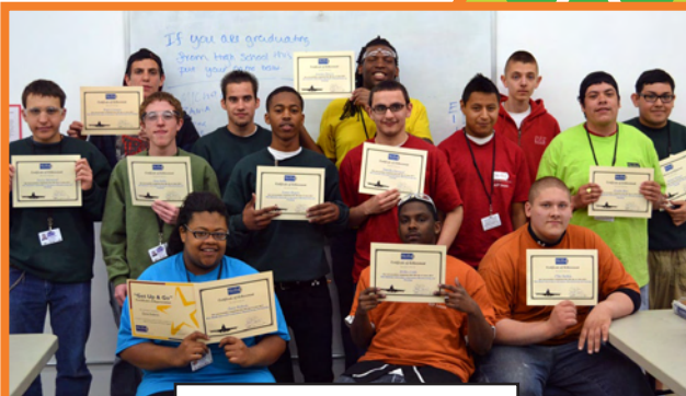
2010 - 2011 AIP Interns