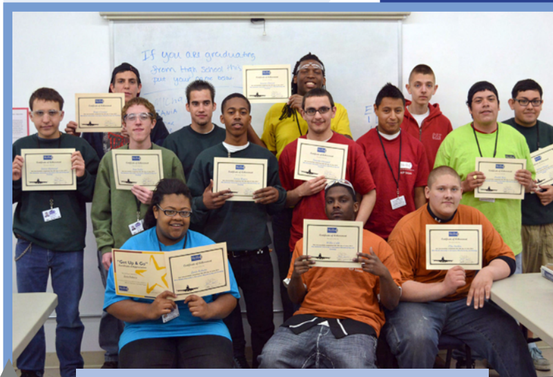
2010 - 2011 AIP Students with their Certificates of Achievement